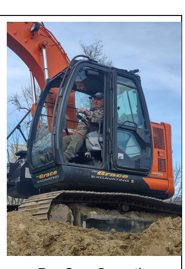
Tom Grace Excavating