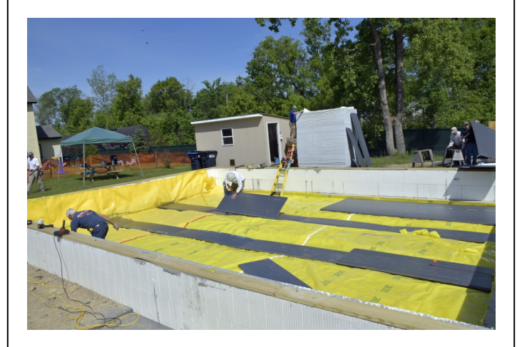
Vanguard Ready to pour the slab. Charitable

Allstate Foundation American Endowment Foundation Huntington Tracy Foundation People's Community Foundation Streetscape Historical Preservation